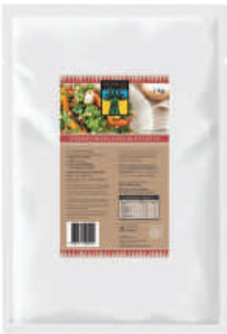
Cooked Wholegrain Freekeh

Our traditional wholegrain Freekeh, cracked to offer a quicker cooking time and crunchier texture.