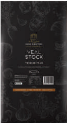
Veal Stock 15 Brix

A premium Beef stock made with flavoursome beef bones offering a truly rich colour & delicious flavour.