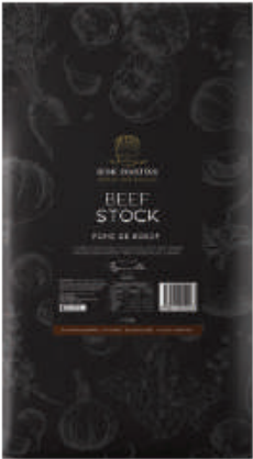
Beef Stock 15 Brix

A premium Beef stock made with flavoursome beef bones offering a truly rich colour & delicious flavour.