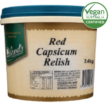
Red Capsicum Relish

Add a deep, smokey tomato flavour to your dishes with Wood's Smokey Tomato Relish.