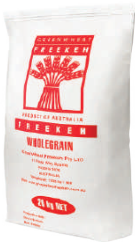
Bulk Freekeh Varieties

Our traditional wholegrain Freekeh cooked and ready to use in less than 5 minutes.