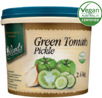
Green Tomato Pickle

A combination of chunky ripe tomatoes and a subtle blend of spices create an exotic flavour.