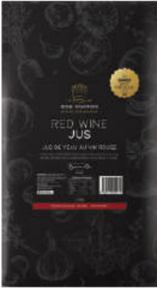
Red Wine Jus 35 Brix

Our Red Wine Jus is a combination of our red wine reduction and our Veal Jus.