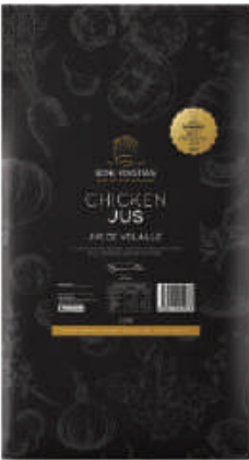
Chicken Jus 25 Brix

Deep in colour, robust in flavour, and made from flavoursome beef bones & our own red wine reduction.