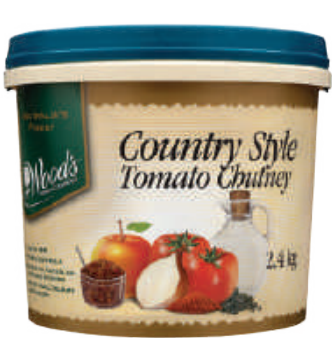
Country Style Tomato Chutney

This delicious chutney is made with plump Australian tomatoes and juicy apples.