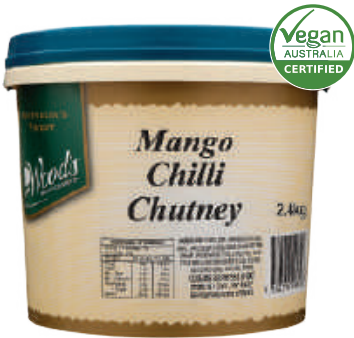
Mango Chilli Chutney

This delicious chutney is made with plump Australian tomatoes and juicy apples.