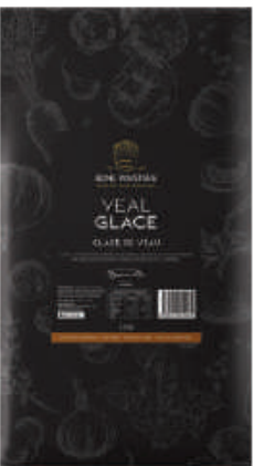
Veal Glace 30 Brix

Reduced from our 15 Brix Veal Stock with no thickeners added and offers a deep caramel colour.