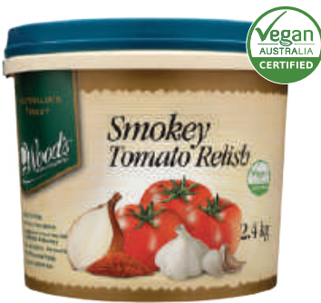
Smokey Tomato Relish

A thick, chunky relish made from plump Australian tomatoes. Great for sandwiches and wraps.