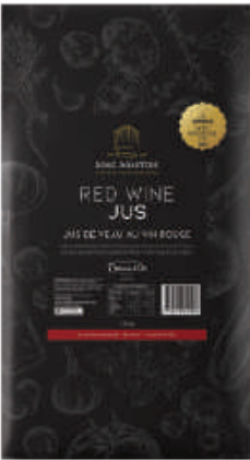
Red Wine Jus 25 Brix

Our Red Wine Jus is a combination of our red wine reduction and our Veal Jus.