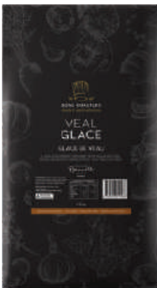
Veal Glace 25 Brix

This product is a reduction from our 6 Brix Chicken Stock, offering an even deeper flavour profile.