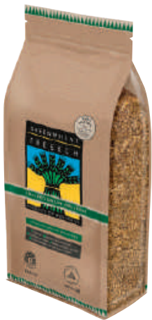
Cracked Grain Freekeh

A versatile superfood packed with nutritional and health benefits Low GI and high in fibre.