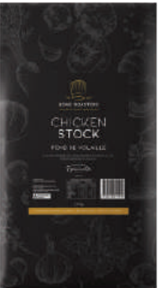
Chicken Stock 6 Brix

Classically crafted, slowly simmered and then filtered to create a clean & clear stock.