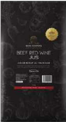
Beef Red Wine Jus 30 Brix

A further reduction of our 25 Brix Red Wine Jus to offer an intense flavour profile with deeper colour.