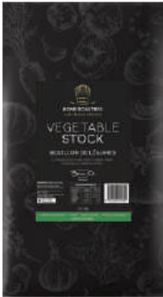
Vegetable Stock 4 Brix

A delicious and pure Chicken flavour with no added salt or additives.